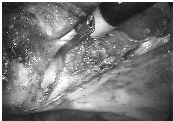
Figure 2. After incising the cardinal ligament, the pliant vaginal wall is palpated laterally, anteriorly, and posteriorly to confirm the location of the cervicovaginal margin. Then, the vaginal wall is incised into with the Ultrasonic scalpel.

OH, USA) suture in 3 or more figure-of-eight (technically spiral) sutures with Semb graspers and a Wolfe needle driver (#8393.502, Richard Wolf Surgical Instruments, Vernon Hills, IL, USA), fixing the vaginal angle to the uterosacral ligaments for suspension.